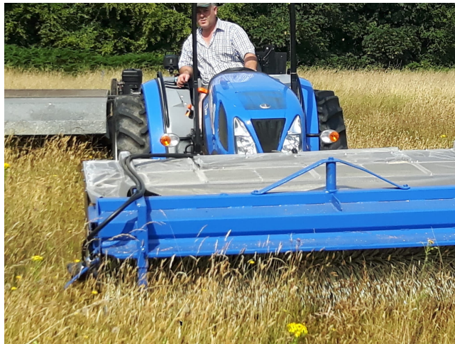
Brush Harvester - can collect from a range of habitats (e.g. meadows, heathlands, wetlands etc)

We collect seed by brush harvesting – EcoSeeds pioneered this methodology in Ireland in 2000 – This uses a gently rotating brush that leaves the donor plant intact. This method causes minimal disturbance to the existing habitat and allows the area to still be cut for hay. Typically we use GPS to measure and harvest a maximum of 80% of an area for no more than three consecutive years – based on ENSPA code of conduct .